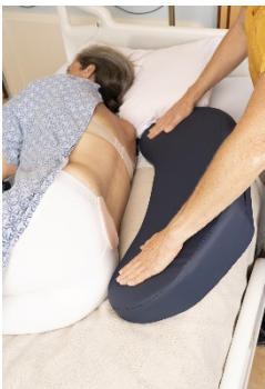
Place to avoid bony prominences / wounds