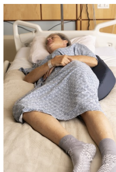
Consistent 30-degree lateral support