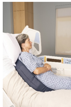
Stays in place after head of bed elevation